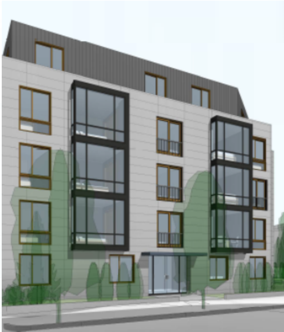
8 WINTER STREET, CAMBRIDGE, MA