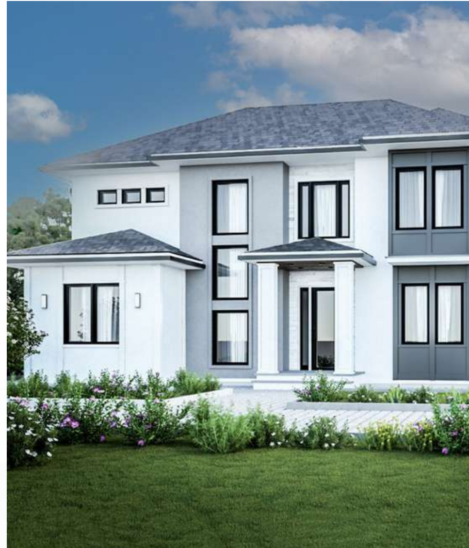
25 NORMANDY ROAD, LEXINGTON, MA