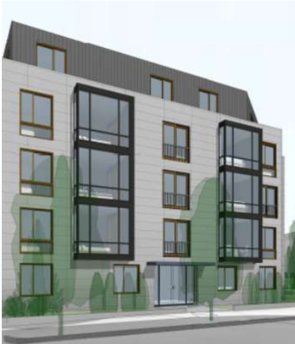
8 WINTER STREET, CAMBRIDGE, MA