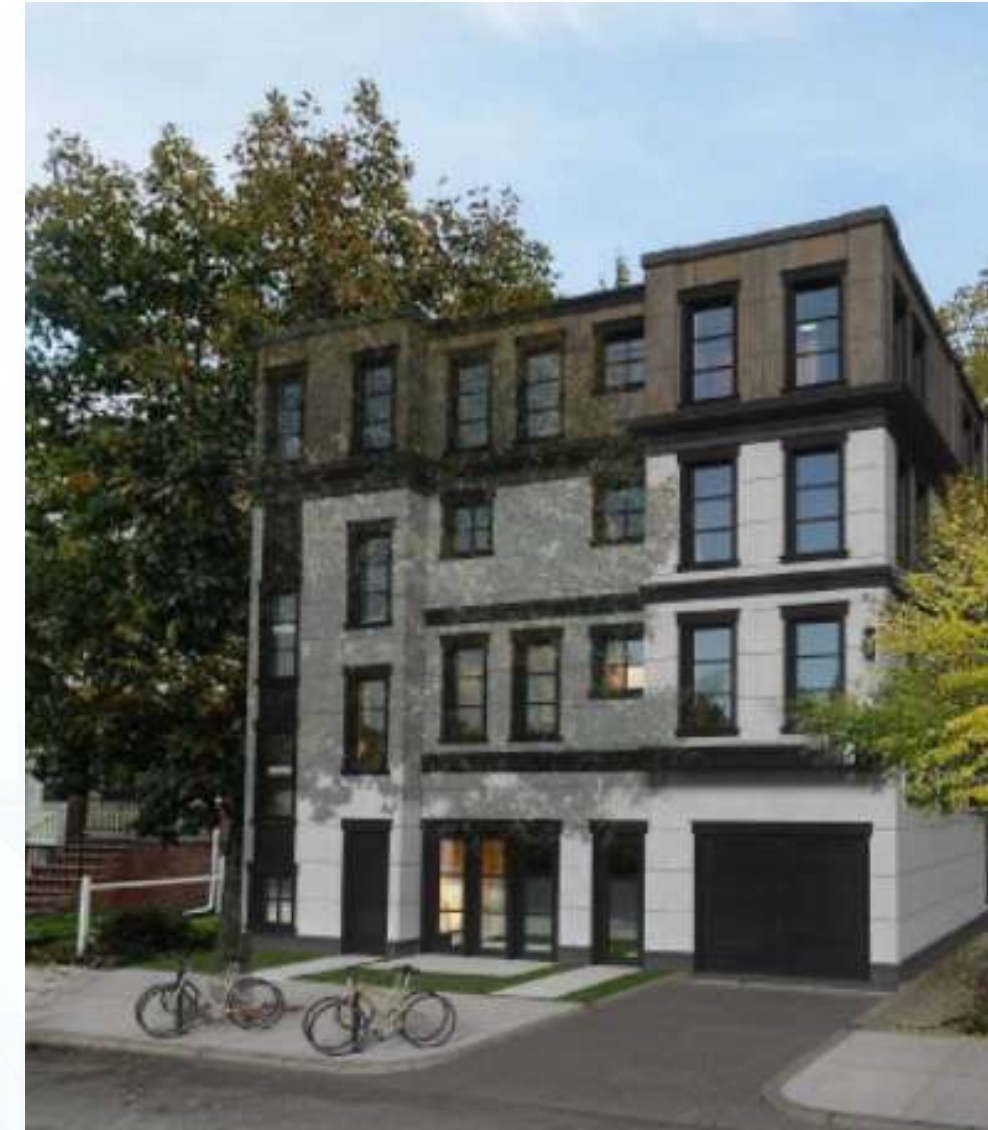
560-562 WASHINGTON ST, BRIGHTON, MA